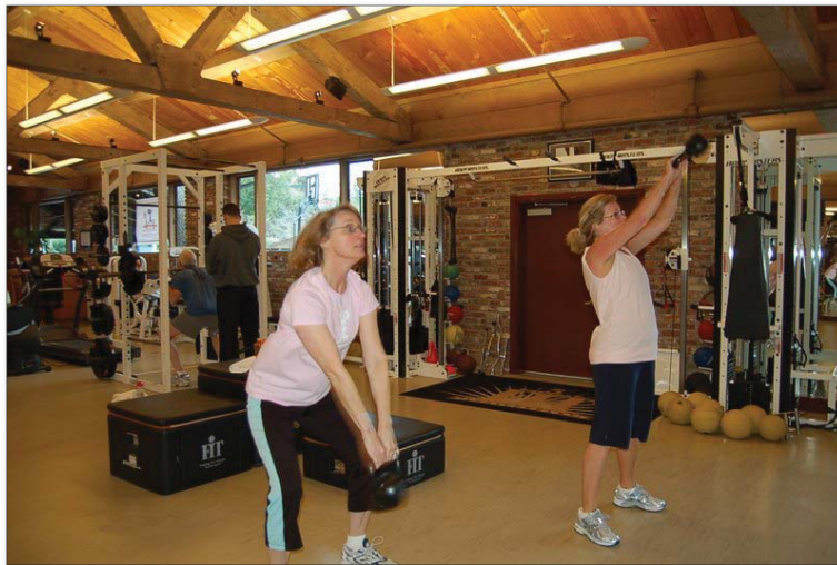
Technique can be learned quickly by observing each other

“I have found that every experience with a partner has been a positive one and that everyone at FIT makes you feel like part of a family of people that really enjoy what