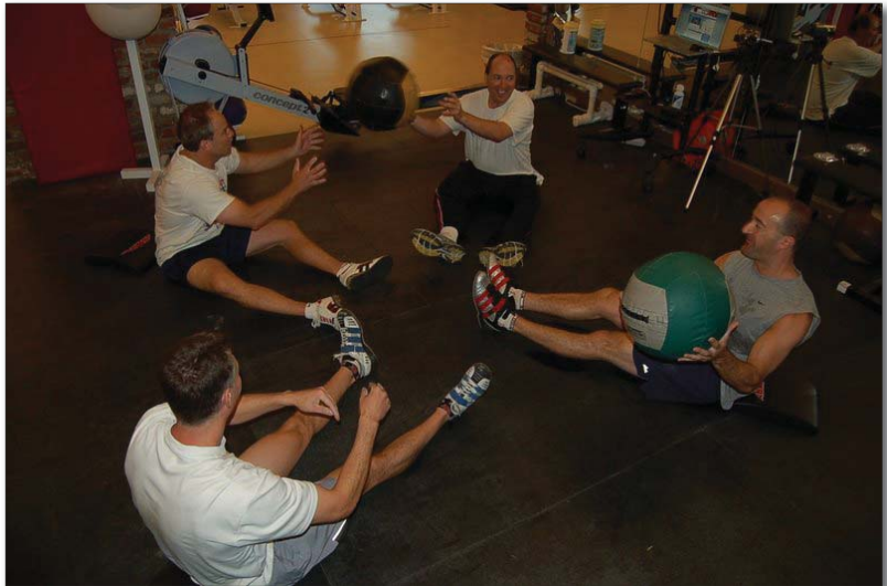
Intensity is more fun in a group

"I love the camaraderie of the group, especially those groups that I have arranged where the women are my friends." Working out in a group is simply more fun! There can be more laughter, friendly battles with our trainer, and say things under breath