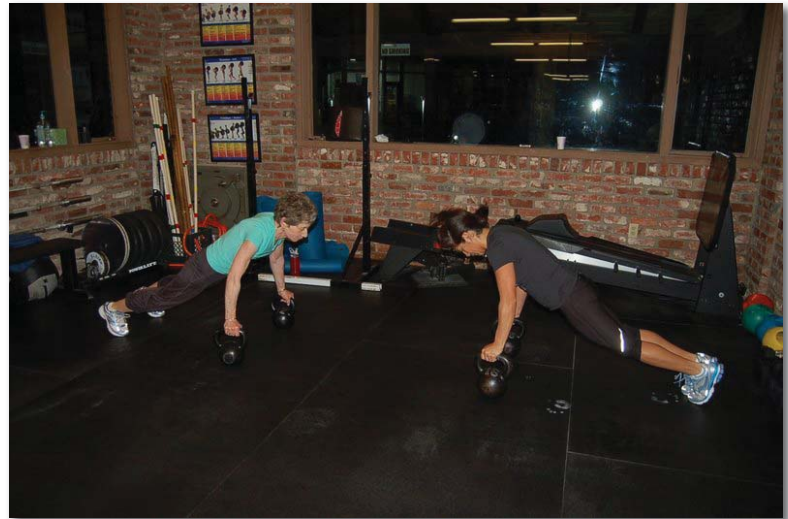
Technique can be learned quickly by observing each other

they are doing, even if it is at 6am!” You will get out of bed. You will diversify your workouts. You will work harder. You will be successful. You will have fun. Remember, you do not have to go at it alone.